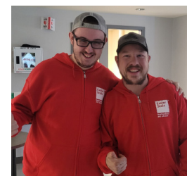
2022 Horizons participants looking fashionable in their Easter Seals hoodies