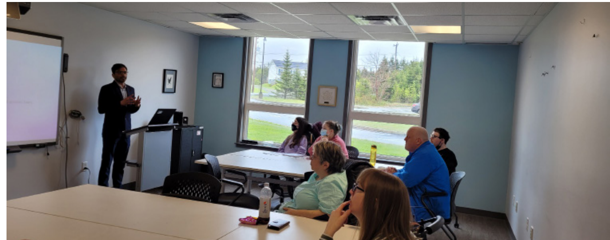
2022 Secure Futures Participants engaged in a presentation from the Community Volunteer Income Tax Clinic